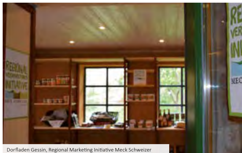
Dorfladen Gessin, Regional Marketing Initiative Meck Schweizer

The Mecklenburg Lake District has a cycle path network of more than 1,400 km. The routes are primarily of tourist significance and lead through the attractive and scenically valuable areas of the region. Due to the central importance for cycle tourism in MSE, the maintenance and further development of the touristic cycle path network are important tasks of the WMSE. The everyday cycle network has an important cross-sectional function with regard to strengthening environment-tally friendly forms of mobility and better networking of the towns. With the construction and qualification of suitable bicycle parking spaces at the stops within the cities, as well as in combination with digital and on-site services (e.g. rental stations, charging infrastructure), attractive transfer relationships between cycling and public transport are created. Due to demographic change, approaches in the field of e-mobility (e.g. electric bicycles) are of particular importance.