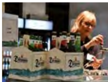
Darguner Brauerei GmbH