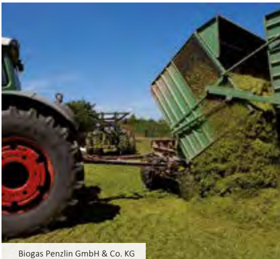
Biogas Penzlin GmbH & Co. KG

2020: coverage of 50 % electricity demand by wind energy alone. By 2030, generation of 3,900 GWh of wind power. Energy supplier MSE (2020): 381