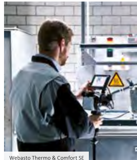
Webasto Thermo & Comfort SE