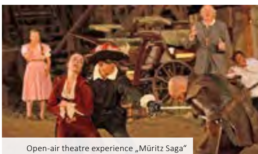
Open-air theatre experience „Müritz Saga“