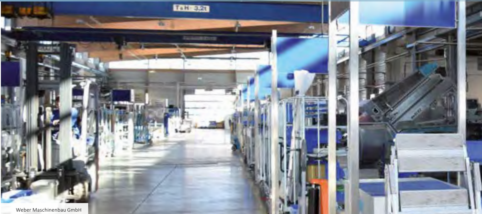
Weber Maschinenbau GmbH

Mechanical engineering, automotive and aviation