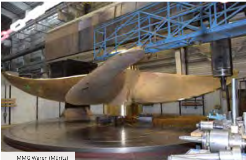
MMG Waren (Müritz)