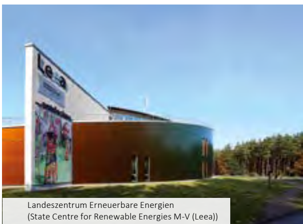
Landeszentrum Erneuerbare Energien (State Centre for Renewable Energies M-V (Leea))

Accordingly, the construction industry is also a key sector of economic development in MSE. The central location of the district with a construction industry hotspot around Neubrandenburg and the proximity to the metropolitan regions of Hamburg and Berlin offer clear economic advantages. The fact that a large proportion of the required building materials are produced in the region is another locational advantage. This is becoming even more important as the trend topic of climate and energy change opens up new potential, especially with regard to insulation with innovative materials and the use of sustainable building materials.