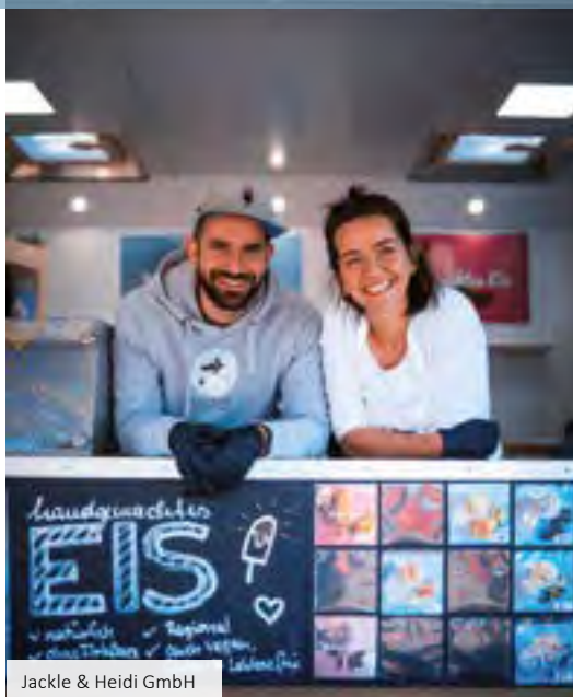
Jackle & Heidi GmbH