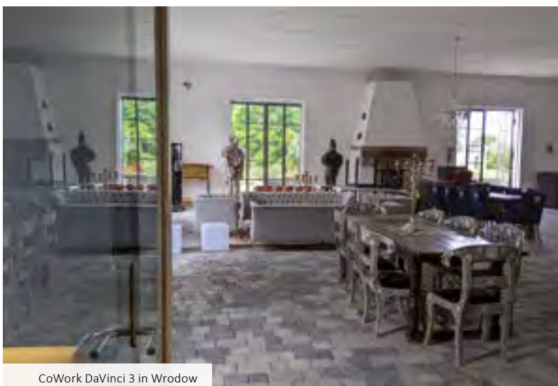
CoWork DaVinci 3 in Wrodow

the hustle and bustle of the big city. In cities or at transport hubs they are often commuter havens and in small towns the new centre of village life - supplemented or integrated into small retail concepts, gastronomy, culture and/ or administration. With the changing working environments during and after Corona, the demand for flexible and mobile working models is increasing, as is the interest of providers to integrate coworks into existing concepts or to start up as a founder with a new offer. Various initiatives such as CoWorkLand e.G., Digitale Innovationsräume, Gründungswerft e.V. provide support in this regard. Unique in Germany is the Coworking Festival M-V, which since 2022 has invited interested parties on a roadshow through the co-working spaces in M-V to meet people, work and perhaps stay there.