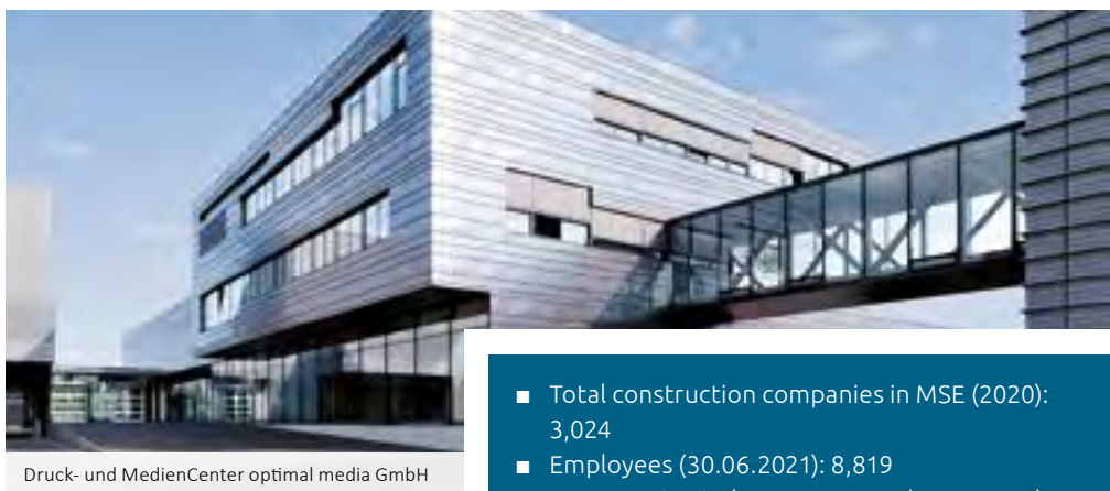
Druck- und MedienCenter optimal media GmbH