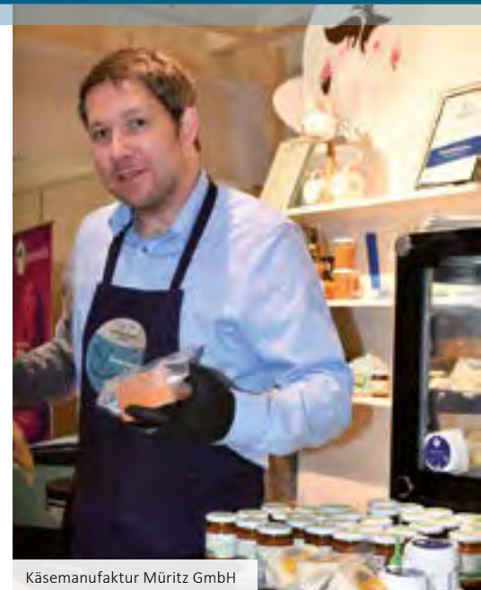
Käsemanufaktur Müritz GmbH

The food industry, as a downstream sector from agriculture, has historically been one of the most important economic sectors in the Mecklenburg Lake District. More than half of the land area in MSE is used for agriculture. The processing and refinement of agricultural products from the region is a quality feature of the food industry in the rural district.