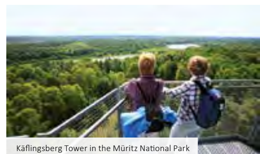
Käflingsberg Tower in the Müritz National Park