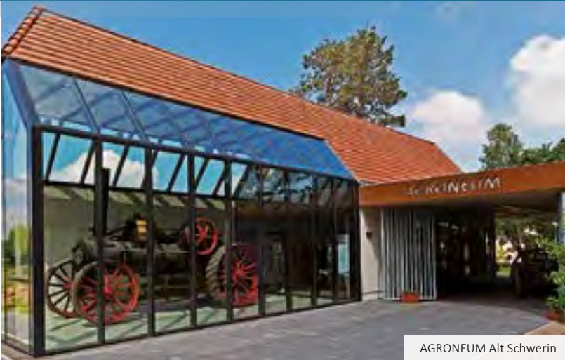
AGRONEUM Alt Schwerin