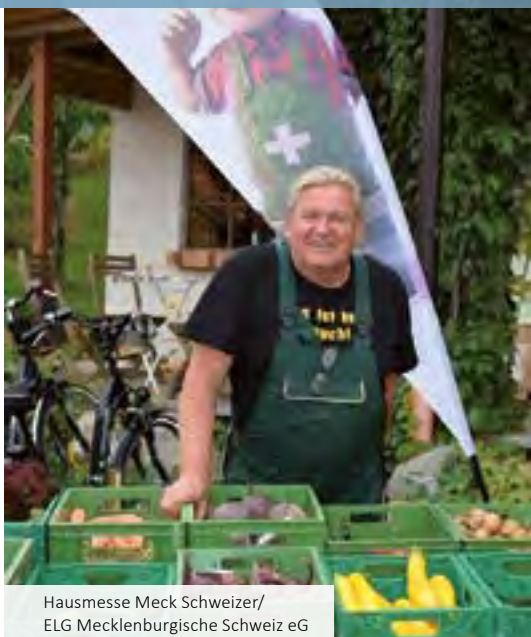
Hausmesse Meck Schweizer/ ELG Mecklenburgische Schweiz eG