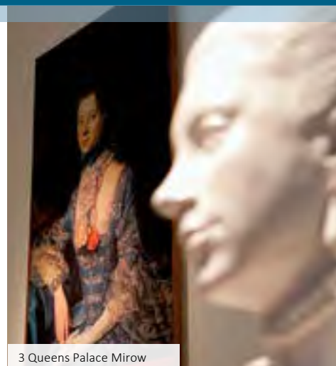
3 Queens Palace Mirow

Mecklenburg-Vorpommern is one of the most efficient recreational regions in Europe and one of the most popular holiday destinations for Germans. In addition to the Baltic Sea coast with its islands, long, fine-sand beaches and more than 57 health resorts, lakeside resorts, seaside spas and climatic health resorts, the inland Mecklenburg Lake District has also long welcomed almost a million guests a year. It impresses with its natural ex-