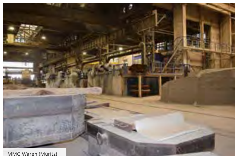
MMG Waren (Müritz)