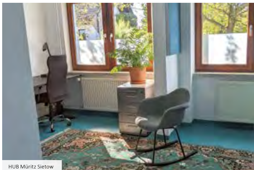
HUB Müritz Sietow