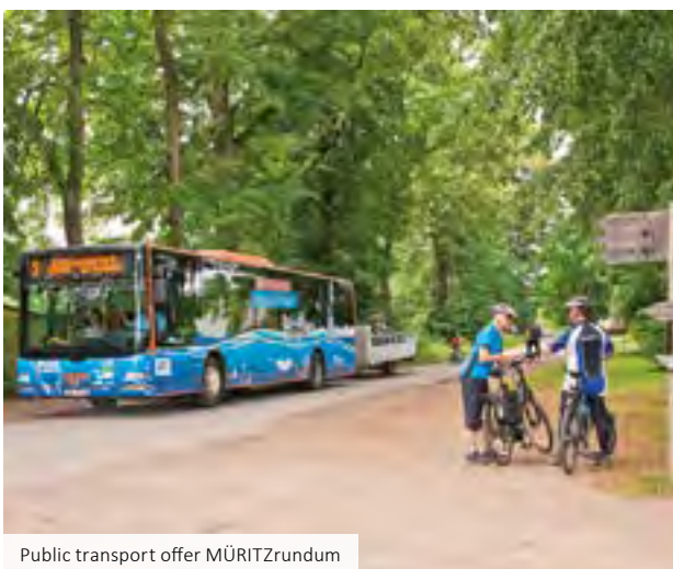
Public transport offer MÜRITZrundum