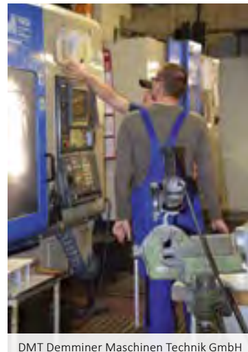
DMT Demminer Maschinen Technik GmbH